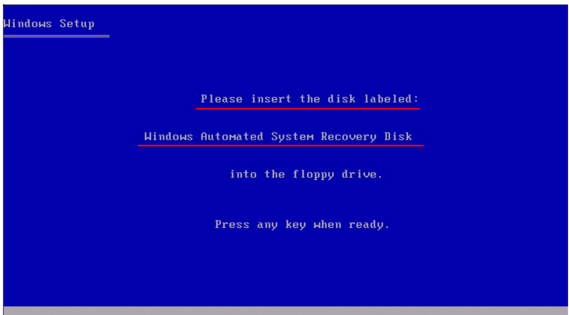
Figure 1-3 Windows Setup screen

Windows Setup proceeds to format the C: drive. Setup then installs a minimal operating system on the C: drive and restores information stored on the back up target device. If you backed up